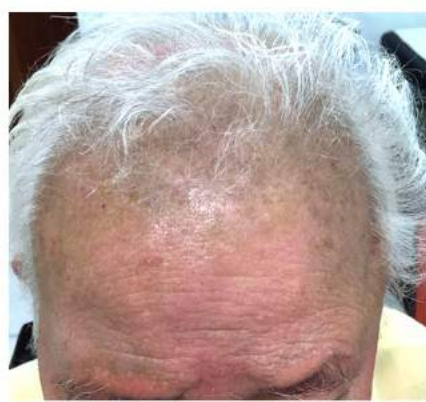
Frontal burr hole covered